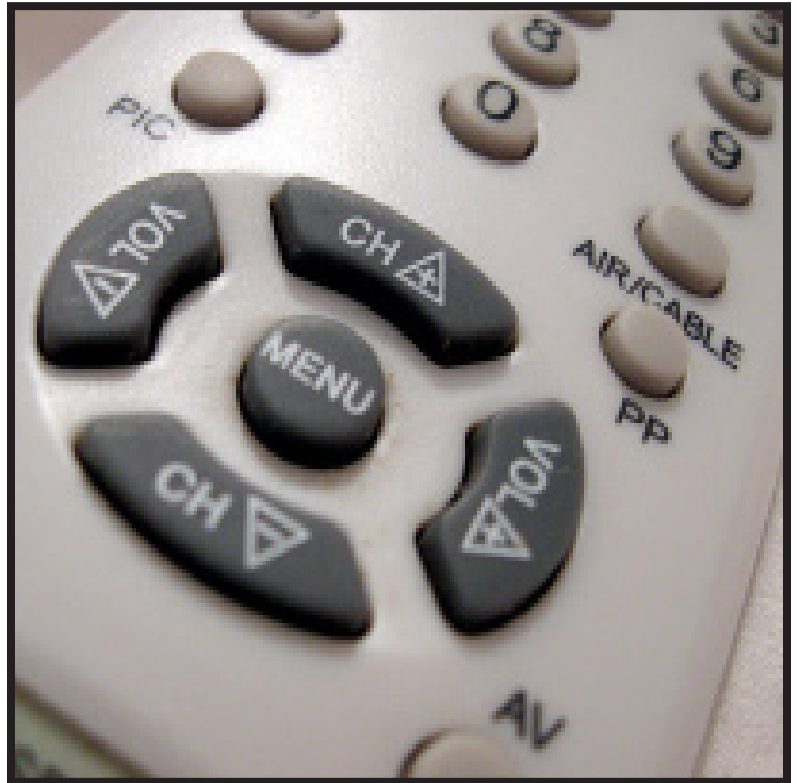
Changing the Channel to ABC to Watch Modern Family

However, the second he giggled at Manny's lame joke and cracked that goofy grin, I realized how much I've missed the Dunphy/Pritchett clan