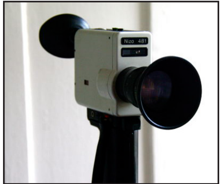
Old camera that was once used to film television.

NBC has also brought multiple sitcoms, like the newly popular Go On , and The New Normal . Both shows have already been picked up for a full season. With the success of FX's American Horror Story last year, ABC seems to be trying their own spin with this year's 666 Park Avenue .